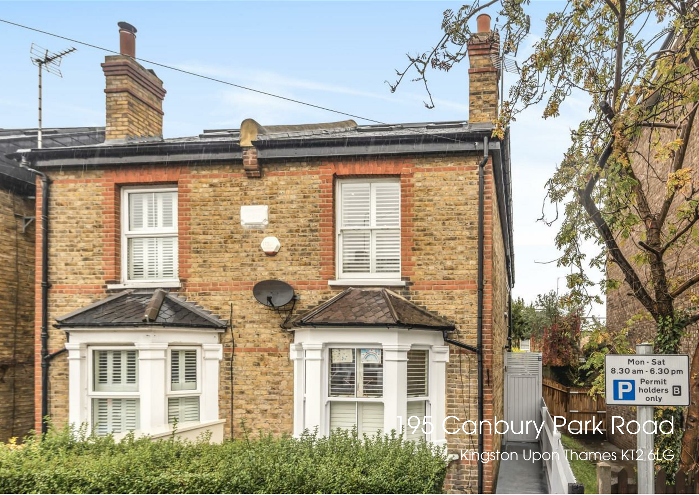
195 Canbury Park Road Kingston Upon Thames KT2 6LG